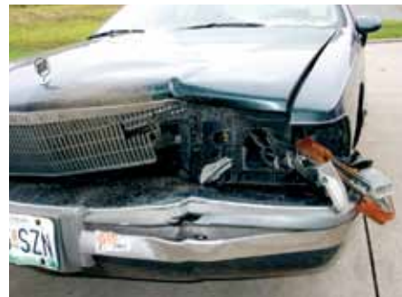
Feral hogs are a road hazard.

or the Missouri Department of Conservation—(573) 522-4115, ext. 3147