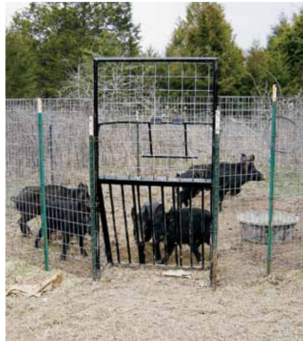
The Missouri Department of Conservation shoots, traps and snares feral hogs on public land. Hunters are encouraged to shoot feral hogs on sight.