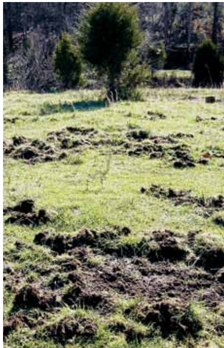
Feral hogs harm wildlife and destroy agriculture.