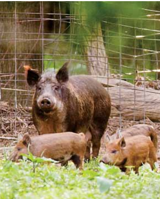
Sows can reproduce at six months and typically have two litters of 4–10 piglets each year. Their numbers can double or triple in just one year.