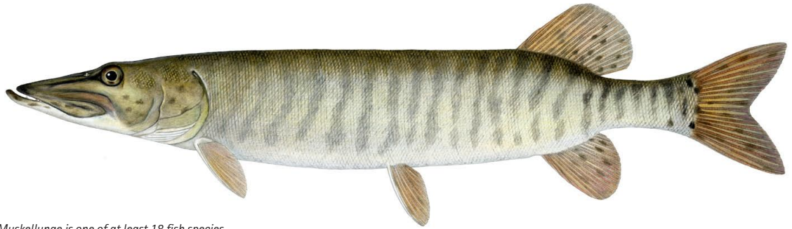
Muskellunge is one of at least 18 fish species in the Great Lakes affected by VHS.